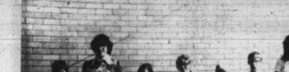
St. Mary's students display banner showing theme of Catholic Schools Week March 7-13th